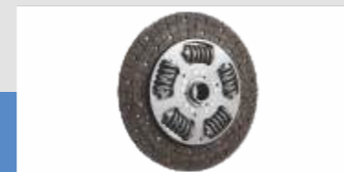
BIGGER CLUTCH SIZE FOR EASY GEAR SHIFTING