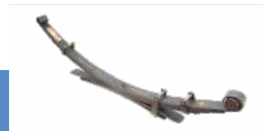
ADDITIONAL AUXILIARY SPRINGS AT REAR