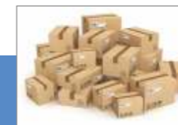
Parcels & courier