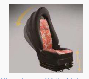
All weather proof Melba fabric seat with features like reclining, Sliding, and Height adjustable as per weight for best in class driving comfort